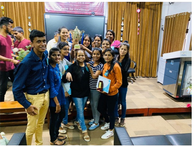
Winners of 'CHEMAURÄ 2020" with the trophy

The students of Department of Chemistry gave an Oral Presentation of their T. Y. B. Sc. Project for "SCIENCE MEGAFEST"